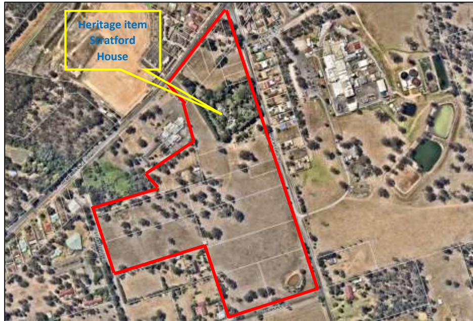
Figure 2 – Aerial photo of the subject site (including lot for drainage easement) – Council's GIS

It is noted that the application is not Integrated Development under section 138(2) of the Roads Act 1993 and Section 91 of the Water Management Act 2000 as it does not meet the requirements of Integrated Development under these acts. This is further investigated below.