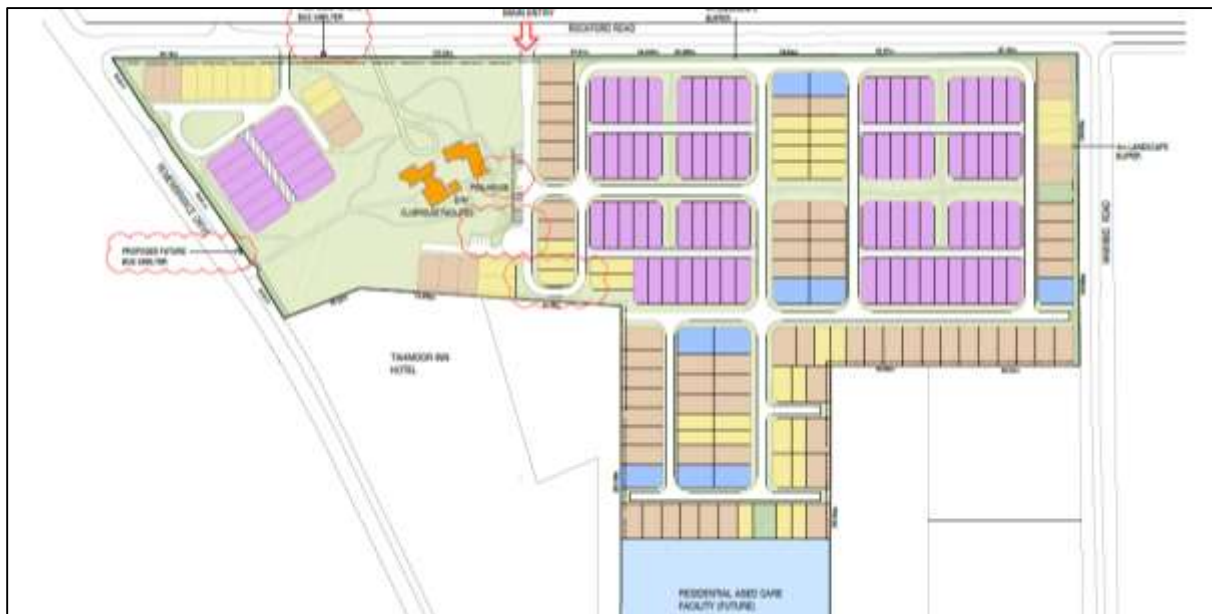
Masterplan Overlay

The development will be constructed in 11 construction stages as depicted below.